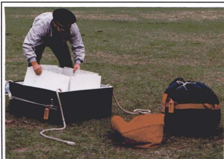
Figure 3: This basket consists of a series of telescoping fiberglass components, each of which bolts to the next. This assembly is similar to the collapsible drinking cups commonly found in camping gear.

bar from which a pilot hangs, a technique at one time used on smoke balloons. The other term is 'heater' which the regulation uses in place of the common term 'burner'.