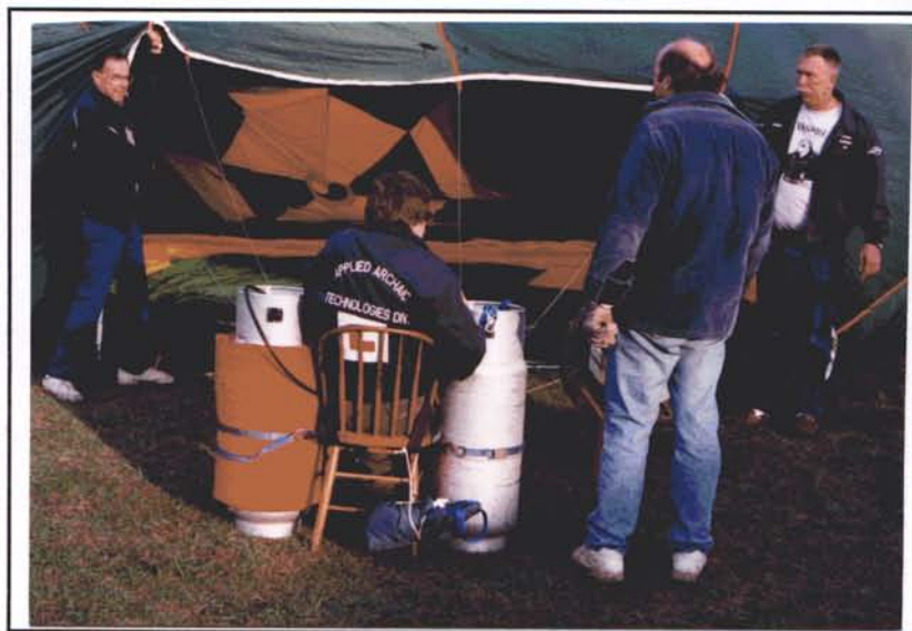
Figure 1: An ultralight chair balloon isn't that uncommon, but a kitchen chair balloon is something else. What special structural considerations would you want to give to this system before you are willing to fly it? This photo was taken at the 1994 Experimental Balloon Meet in Vermont.

(Sec. 31.57 a) If a rip cord is used for emergency deflation, it must be designed and installed to preclude entanglement.