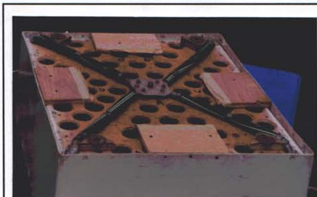
Figure 4: This is a bottom view of the basket seen in figure 3. Note the lightening holes in the basket floor.

These instrumentation requirements are for type certified balloons. If you choose to forego instrumentation, be prepared to explain your reasons for that decision to your FAA inspector.