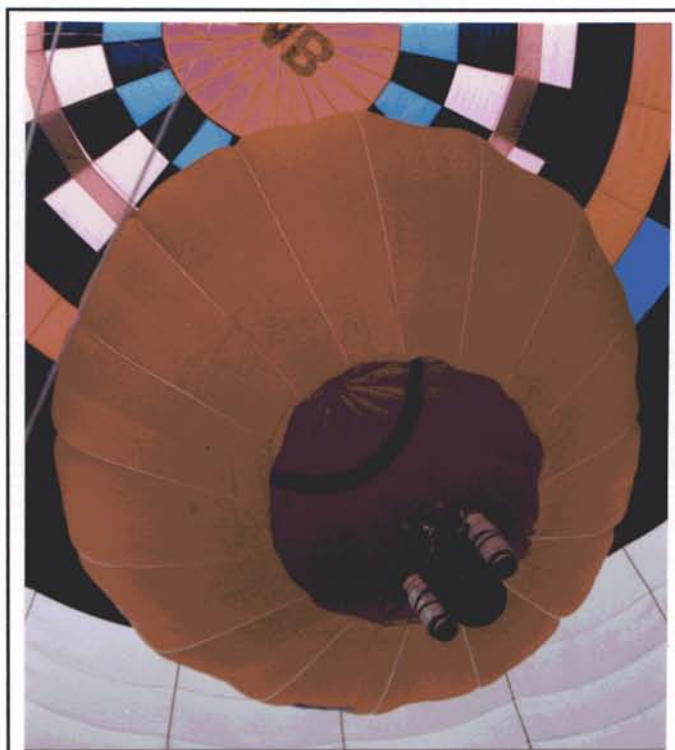
Figure 2: This is a photo of an ultralight balloon flying inside an AX-10 envelope. The small balloon utilizes a basket constructed from a plastic garbage can with a 10 gallon Worthington tank hung from either side.

By the way, Part 31 makes use of two terms which are antiquated: 'Trapeze' refers to a